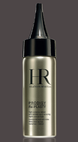
Re-PLASTY HIGH DEFINITION PEEL

REPLICATED FROM LACLINIC MONTREUX MOST ADVANCED CLINICAL PROTOCOLS Formulated and tested with Laclinic Montreux