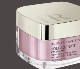
COLLAGENIST with pro-XIII